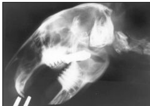
Radiograph Showing Capsule in Esophagus