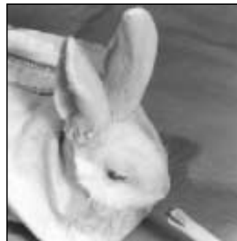
Rabbit Restrained in Cat Bag