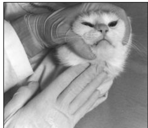
Stroking To Facilitate Swallowing