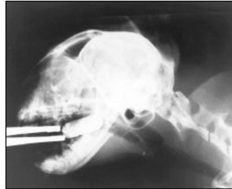
Radiograph Showing Capsule in Esophagus