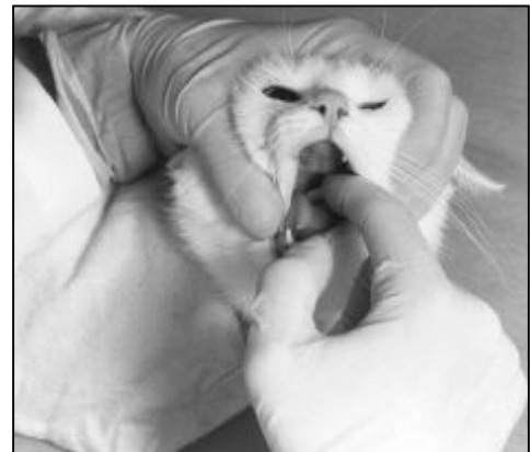
Capsule Dosing via Hand Pilling Method