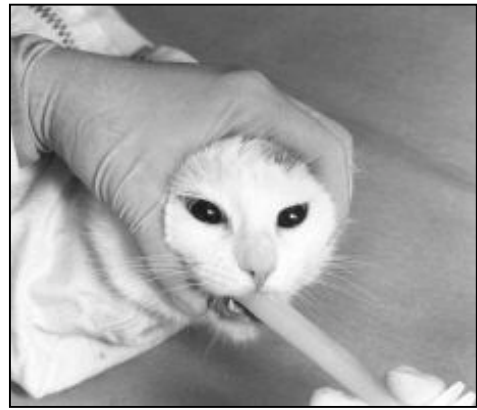
Capsule Dosing via Pilling Gun