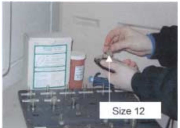
Filled capsule is place inside fish body.