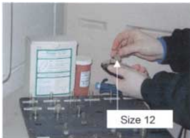
Filled capsule is place inside fish body.