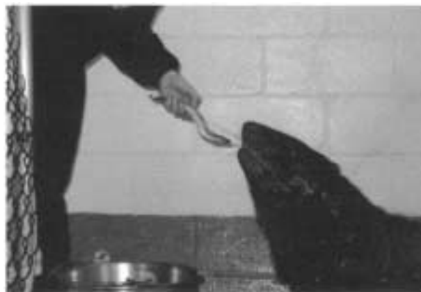
Fish with capsule inside can be fed to a variety of marine animals including seals, sharks, whales, dolphins and penguins.