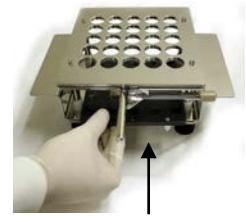
3. Re-install the Dome Plate as shown above.