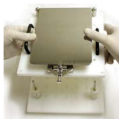
13. Place the Capstray containing prelocked capsules on Locking Base by placing it over the Locating Pins.