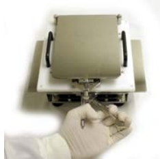
5. Before separating the capsules you must lock the bodies by, rotating the Cam Handle to desired degree (approx 60 to 80).