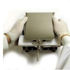
6. Separate the cap & body by pressing thumbs down on Caps Tray Handles and lifting the Caps Tray up with fingers.