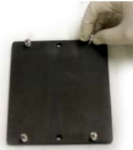
2. Turn the Plate over and install the Dome Plate Feet that correspond with the capsule size to be filled.