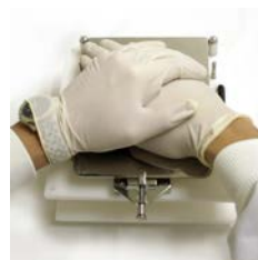
14. Now lock the capsules by applying pressure with both hands (palms) as shown.