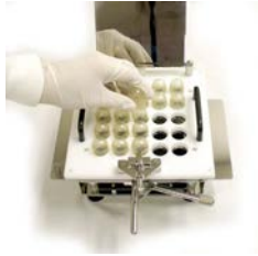
4. Load the capsules into the Caps Tray (longer narrower side first). Close the Locking Plate & Clamp to secure.