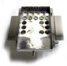
8. Place the Powder Tray on the Filler by fitting the holes onto the Locating Pins on the Filler, keeping the Powder Pocket towards operator side. Pour pre-measured powder into filler.