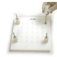
12. Select corresponding Lock Spacer with capsule size being filled. Place selected Lock Spacer in the Locking Base as shown. This prevents over-locking of capsules.