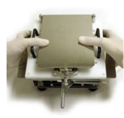
11. After capsules are filled remove Powder Tray and place the Caps Tray back into position. Prelock the capsules by lifting the Lifting Plate as shown. Do not try to lock capsules on Filler.