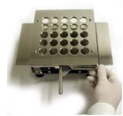
7. Rotate the Cam Handle back to home position; the capsule bodies will fall down. Now the capsules are ready to fill.