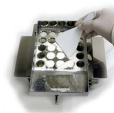
9. Spread the powder evenly with the help of Powder Spreader. Push excess powder onto reservoir of Powder Tray.