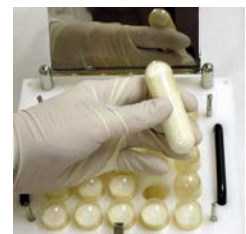
15. Remove capsules from the Caps Tray. You now have completely locked and filled capsules. With practice you can fill 400+ capsules per hour.